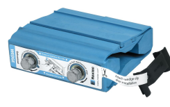
Wedge & Wedgekit